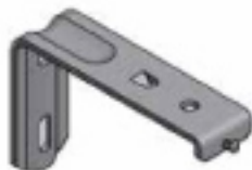
Face fix screw fit bracket

There are a number of bracket options for example face fix, top fix, screw fit or spring fit.